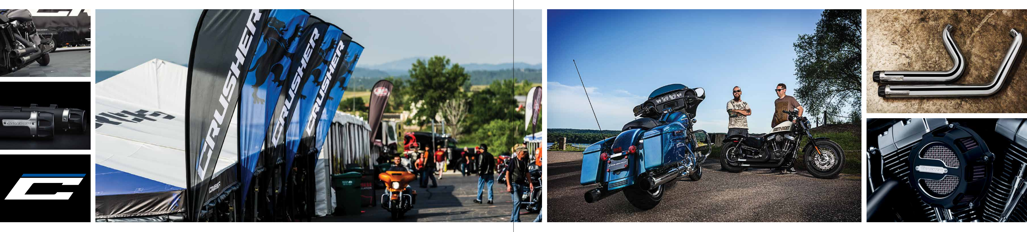
THE PERFORMANCE DIVISION OF KURYAKYN WWW.CRUSHERPERFORMANCE.COM