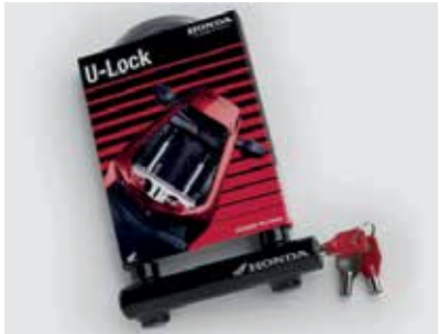
U-LOCK 08M53-MFL-800 Tamper resistant barrel key U-lock.