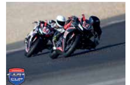
The CBR500R Cup.

It's not rare to find some CB500 proudly boasting more than 300,000 kms (more than 186,000 miles), but the long-time favourite of the couriers and the driving school is much more than a workhorse. Beginning in France in 1996, the CB500 Cup spread across Europe quickly. Since 2014, it is on CBR500R that young talents try to make a name by themselves, on a budget. Sebastien Charpentier or James Toseland, to name a few, started there.