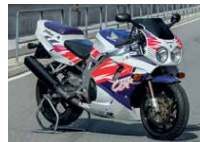
The CBR900RR Fireblade that started all.

Aiming to create a high-performance motorcycle that could defeat its own RVF750 in Endurance Road Races, Honda developed an R&D project that led directly to the CBR900RR, in 1992. With 128 HP, it was not the most powerful of its time. However, thanks to a dry weight of 185 kg when all rivals were well over 200 kg, the first Fireblade, soon nicknamed "Blade" by the fans, was so easy to control that it seemed to read its rider's mind. More than 25 years after, the most powerful and nimble Honda bikes keep carrying the Blade legacy.