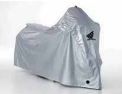
OUTDOOR CYCLE COVER 08P34-BC2-801 A water-resistant and breathable cover that allows your bike to dry whilst covered. Protects the paintwork from UV rays. Supplied with an anti-flutter rope and two security holes.