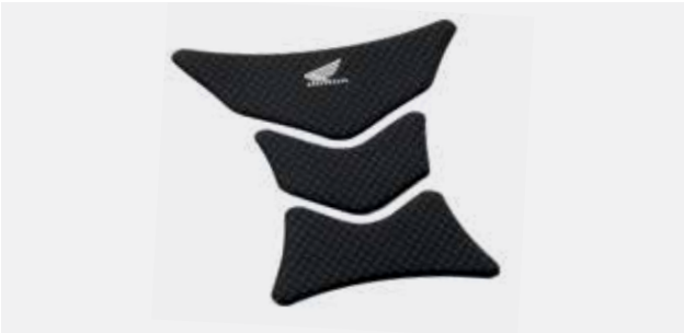
TANK PAD (HONDA WING LOGO) 08P61-KYJ-800 3-piece adhesive-backed tank pad in a carbon fibre effect and featuring the Honda Wing. Helps to protect tank paintwork from scratches and rubbing.