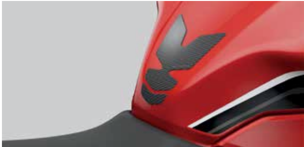
TANK PAD (CBR LOGO) 08P71-MKF-DK0 Arrow shaped grey tank pad featuring the CBR logo. Helps to protect tank paintwork from scratches and rubbing.