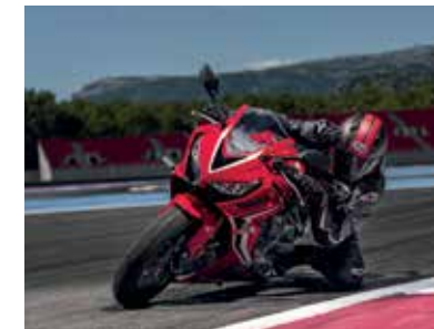
The CBR650R in action.

Since 1992 with the ST1100 aka "Pan European" model, Honda equips more and more its motorcycles with a system called Honda Selectable Torque Control (HSTC). This system monitors constantly the speeds of the front and rear wheels via speed sensors incorporated into the Anti-Lock Braking System (ABS). When the rear wheel begins to rotate significantly faster than the front, the systems reduces fuel delivery to the engine and limits rear-wheel slippage. In 2019 with the new CBR650R, Honda applied this technology for the first time to its mid-displacement SuperSport motorcycle. The rider can deactivate it on demand.