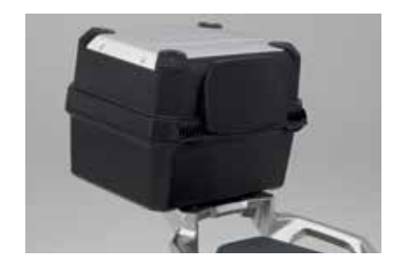
38L TOP BOX WITH KEY SYSTEM 08ESY-MKT-TB35OK

Give your 50L Top Box the final touch with this Aluminium design panel (top box not included).