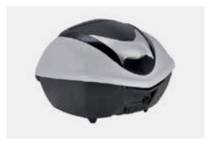
35L TOP BOX