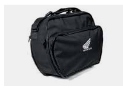
35L TOP BOX INNER BAG