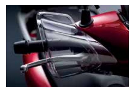
CLEAR KNUCKLE GUARDS SET

Elegant, resistant and flexible, this windshield guarantees a clear visual field and a great upper body protection for the rider, without impairing the maneuverability of the scooter.