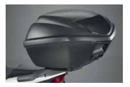
35L TOP BOX KIT 08ESY-K1Z-35TB

35\mbox{-litres} plastic Top Box with a backrest that can store 1 helmet.