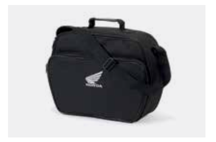
INNER BAG FOR 35-L TOP BOX