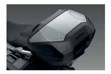
ALUMINIUM TOP BOX PANEL 08L83-MKT-D00

Give your 50L Top Box the final touch with this Aluminium design panel (top box not included).