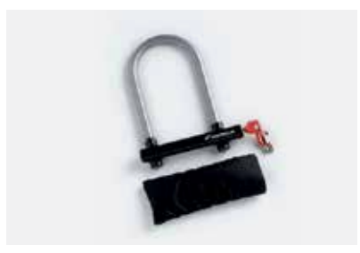
U-LOCK L-TYPE 08M53-MEE-800

Easy to install thanks to the ready-to-use holes of the bodywork.