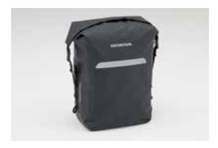
50L TOP BOX INNER BAG

Must be combined with a rear carrier (sold separately).