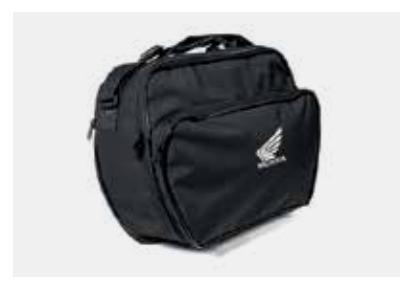
35L TOP BOX INNER BAG 08L09-MGS-D30

Black nylon bag with silver honda logo on front pocke. Expandable from 15 to 25L. The front pocket can contain an A4-size file. Comes with adjustable shoulder belt and carrying handle.